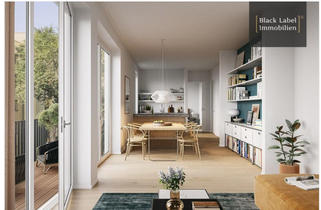
Example Living and dining area