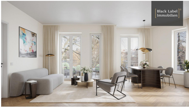
Example living area