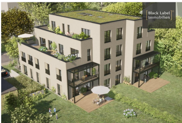
House11 exterior view