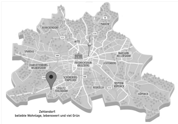
Lage Berlin Zehlendorf