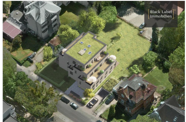
House11 exterior view