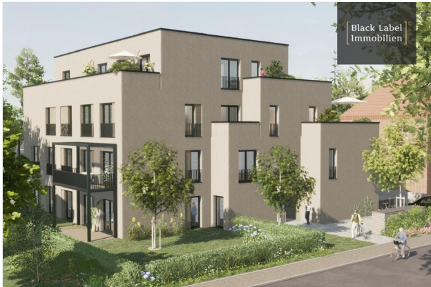
House11 exterior view