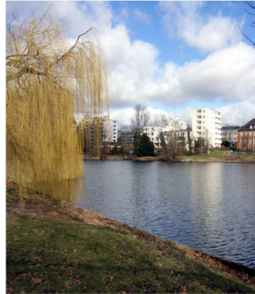
Nahe am Lietzensee