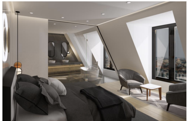
DG offener Wohnbereich