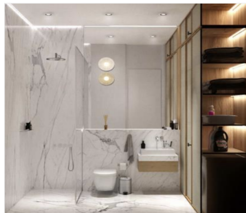
Badezimmer V 2