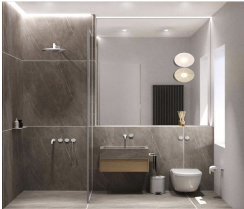
Badezimmer V 3