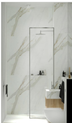
Badezimmer V 1