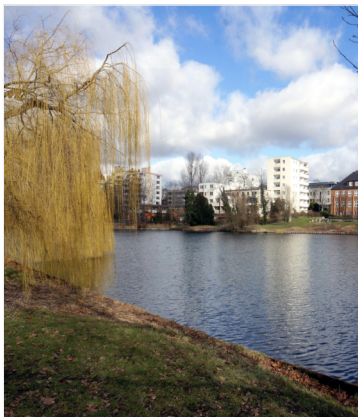
Nahe am Lietzensee